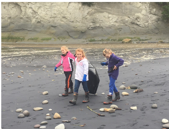
Wai-Iti Beach Clean Up

As you will read in this newsletter the students have really grabbed the bull by the horns and made the most of every learning opportunity they have had. From the Tainui Cross Country and Speech Competitions to the Taranaki Arts Festival, Beach Clean Up, learning about Egypt, and involvement in the EnergySkillsNZ Science Fair as well as the Magic Show and a visit from Taranaki Bulls the students have exceeded all expectations.