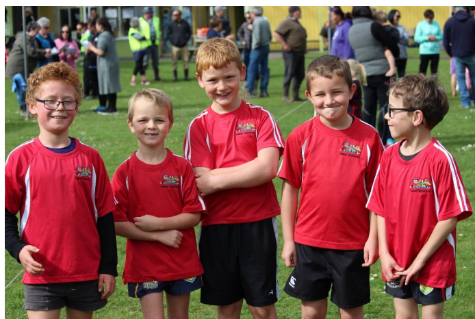
Start line-up at the Tainui Cross Country

the community's desire to do everything it can to provide awesome learning opportunities for the students. The number of you who are prepared to drop every-