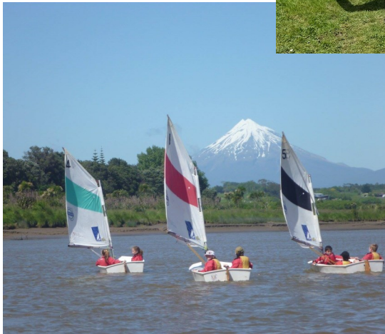
The year five and six students had sailing on the Wai-tara River

and the year four to six students finished the year with the camp to Green Pastures.