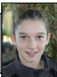
Whittaker-Phillips Family Cup for Sporting Achievement