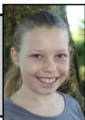
Baker Family Cup for Literacy Achievement